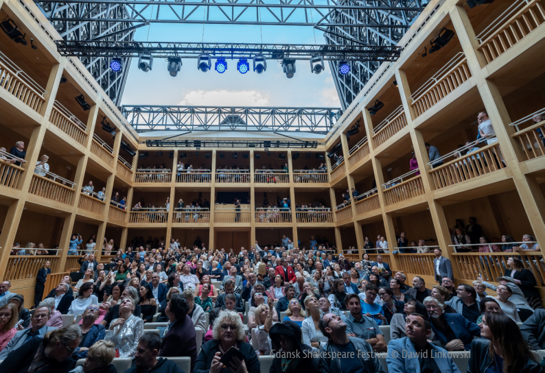
Edansk Shakespeare Festival