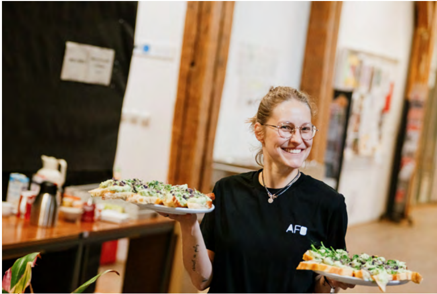
AFO Olomouc