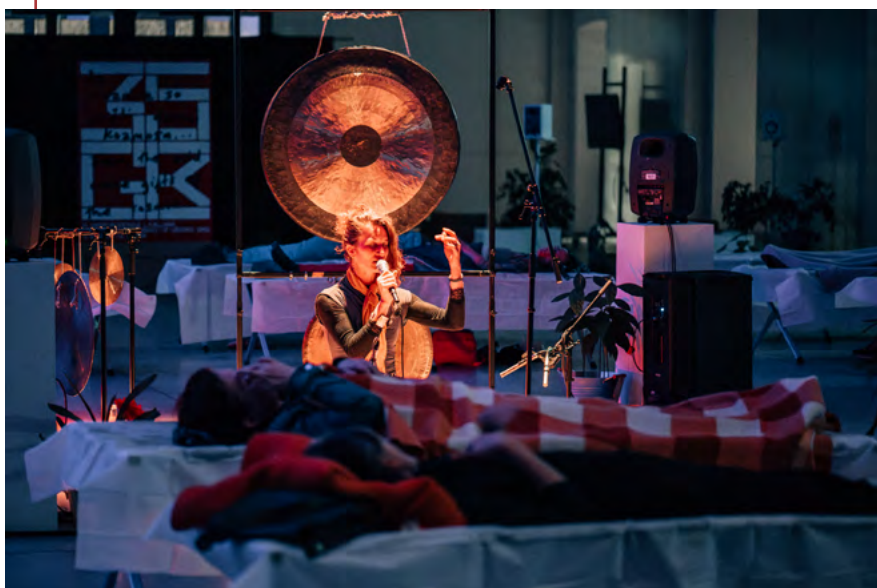
©Foto Blaž Gutman, arhiv Cukrarna_Festival of radical sound walks TO)po

TO)pot “walking practices of reading, creating, grounding, immersing, being acted upon and acting in the environment.” – Festival of radical sound walks TO)pot in the city of Ljubljana